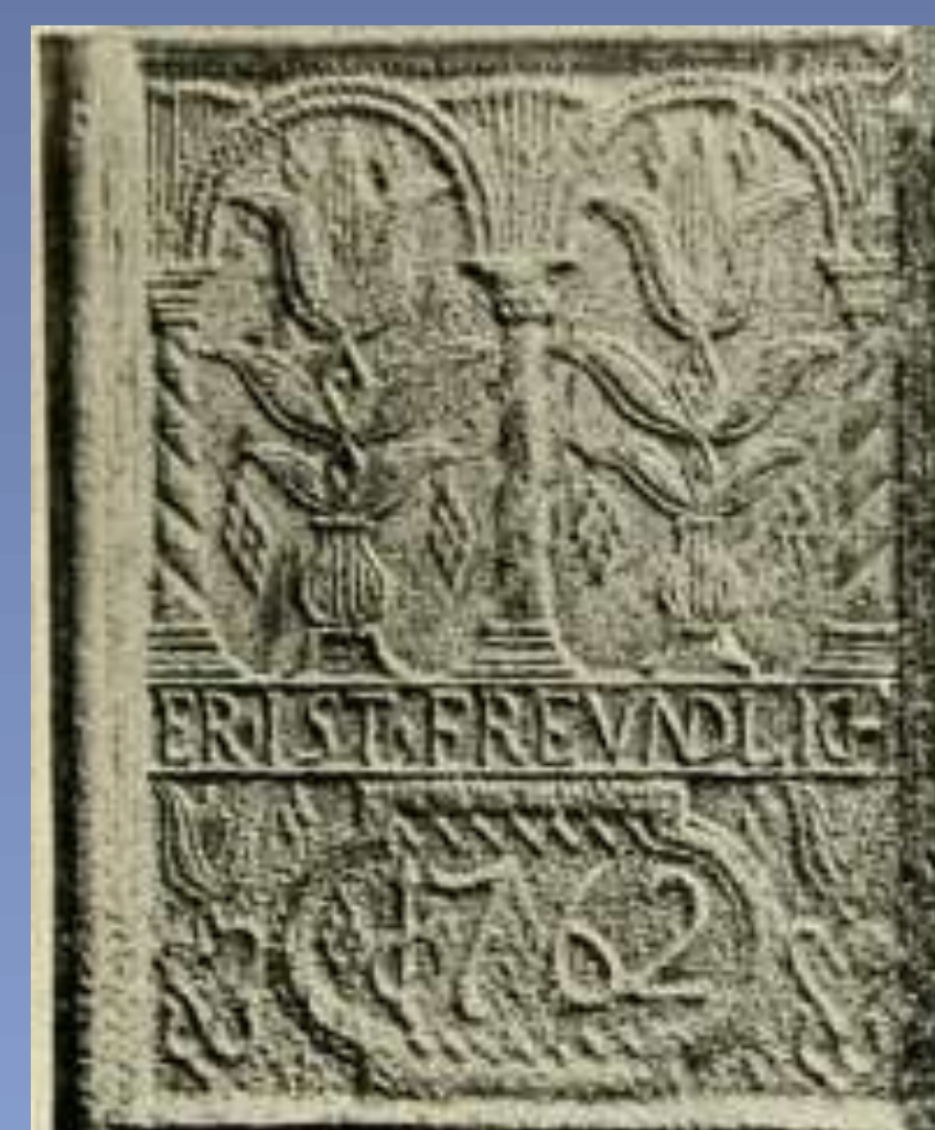
Figure 4: Example of what the front plate of the jamb stoves recovered from Antietam Furnace may have looked like (Mercer 1914: Plate 141).

The eight complete stove plates recovered from Antietam Furnace all had this floral motif, which included a combination of lozenges, hearts, and tulips. This design became ubiquitous on jamb stove plates after the mid-1750s. Having no known religious significance, it is unclear why the more interesting pictorial scenes were abandoned for it (Mercer 1961: 70-72). A German inscription in the center of the plate read "DANKET DEM HERN DEM", which translates "Give thanks unto the Lord". The verse was completed on the front plate: "ERIST FREUNDLICH", which translates "He is good." Only a few fragments of the front plate survived at the Antietam Furnace site (Frye 1984: 95). A complete example is illustrated in Mercer (1961: Plate 141) (Figure 4). The initials "WJ", "WB", and "BH" stand for the furnace owners William James, William Buchanan, and Barnabas Hughes (Figures 1 and 3). The initials "AD" are those of an unknown individual, but one who likely had an important role in the furnace's operation (Frye: 1984: 95).