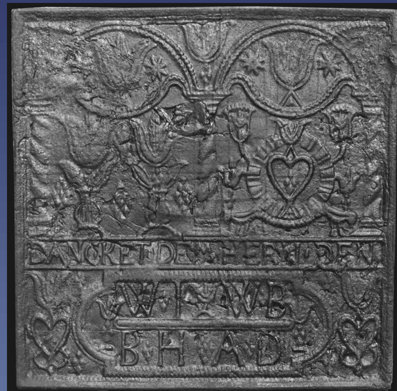
Figure 1: Conserved stove plate from the Antietam Furnace site.

In the early 1980s, archaeological investigations uncovered the remains of Antietam Furnace, a well-preserved 18th century frontier blast furnace, in Washington County. Constructed in 1761, this furnace produced a variety of cast iron objects, as well as "pig iron", which would have been further refined to make wrought iron. The blast furnace was in operation up until the American Revolution, when the owners received large contracts to cast cannon from the State of Maryland and the Continental Congress. Since Antietam Furnace was too small for this purpose, it was abandoned and the larger Mt. Aetna Furnace was constructed nearby in the mid-1770s (Frye 1984: 159).